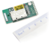
T24-SA Acquisition Module Strain gauge to radio telemetry converter