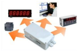
T24-SO Radio telemetry input, data output for displays and printers