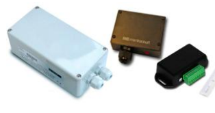
T24 Acquisition Module Enclosures Strain gauge to radio telemetry converter