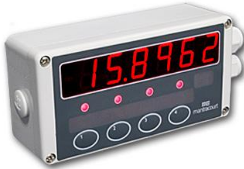
Data input display for digital load cells and wireless