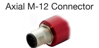
Axial M-12 Connector