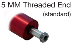
5 MM Threaded End (standard)