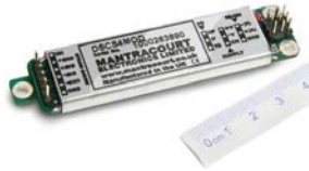
DSC Strain gauge data converter to RS232. Modbus, CAN, RS885