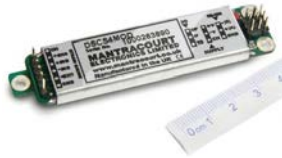
DSC Strain gauge data converter to RS232. Modbus, CAN, RS885