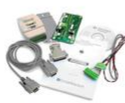
EVAL KIT Evaluations kits for DCell and DSC are available for stress free set up. Strain gauge data converter to RS232. Modbus, CAN, RS885