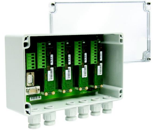
Photo showing DSJ4 with 4 x DSC pcb cards fitted & in ABS surface mounting case