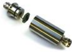
ILE Stainless steel enclosure for DCell data converters and ICA