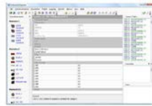
Instrument Explorer Quick set up software event monitoring, data logging, calibration and configuration