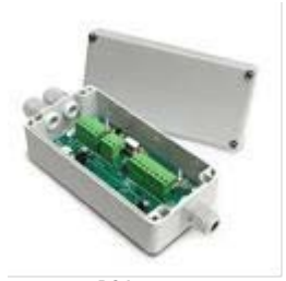
DSJ1 & 4 Strain gauge data converter to RS232. Modbus, CAN, RS885 available as single or 4 channel IP65 enclosure