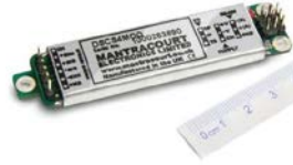
DSC Card version available the strain gauge data converter to RS232. Modbus, CAN, RS885