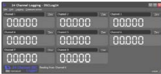
24 Channel Logging View and log up to 24 channels